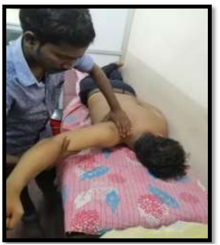
Fig 3: Lower trapezius weakness test