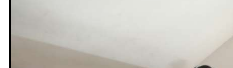
Fig 1: Pectoralis major contracture test

A positive test occurs if the elbows do not reach the table and indicates a tight pectoralis major muscle (Fig 1)